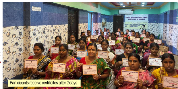
Participants receive certificates after 2 days