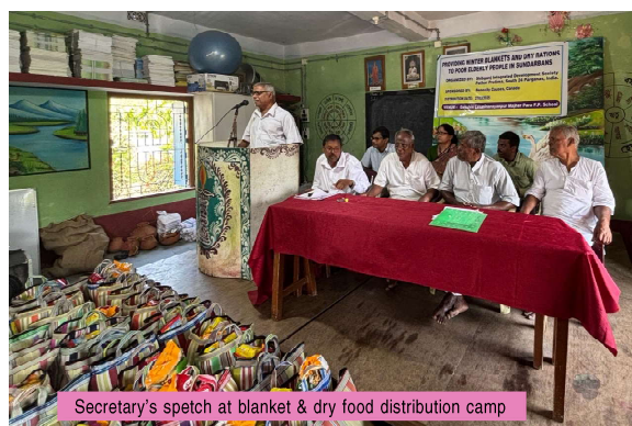
Secretary's speech at blanket & dry food distribution camp