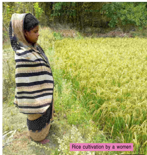
Rice cultivation by a women

Every year SIDS starts agricultural development programs by adding new areas. Among the objectives of the organization,