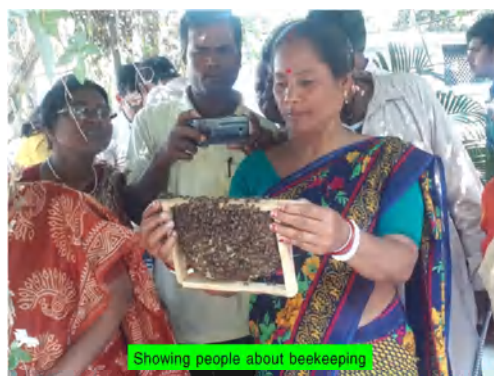
Showing people about beekeeping

Seminars can effectively raise awareness about biodiversity conservation by providing a platform for experts to share knowledge, engaging participants through interactive discussions, and promoting a deeper understanding of the importance of biodiversity and its conservation. Seminars can feature presentations and talks by experts in biodiversity conservation, sharing the latest research, conservation strategies, and the importance of biodiversity for ecosystems and human well-being. Wall writing, also known as street art, can be a powerful tool for raising awareness about biodiversity conservation by visually communicating its importance and inspiring action. By combining engaging visuals, emotional storytelling, and informative content, videos can effectively