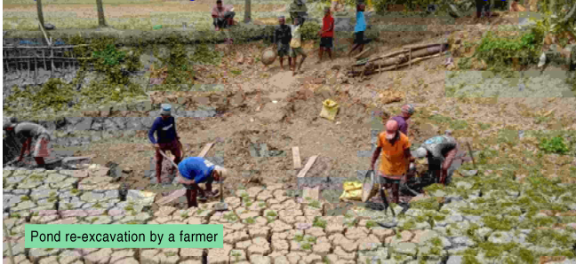
Pond re-excitation by a farmer

groups are the beneficiaries of this project. The project will not only solve the food problem but also provide employment. Dependence on agriculture will increase among generations,