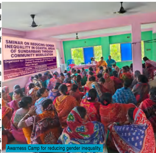
Awareness Camp for reducing gender inequality.