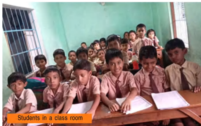
Students in a class room