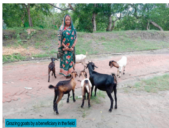
Grazing goats by a beneficiary in the field

Indigenous goat rearing is highly important in the Sundarbans for providing a sustainable livelihood for many, particularly women and landless populations. These goats, like the Black Bengal breed, are well-adapted to the local environment, offering meat and milk, and contributing to food security and economic empowerment. Goat meat is highly popular and in demands both locally and in urban markets. Indigenous goats, particularly the Black Bengal, can provide a good amount of milk, supplementing household nutrition and potentially generating income.