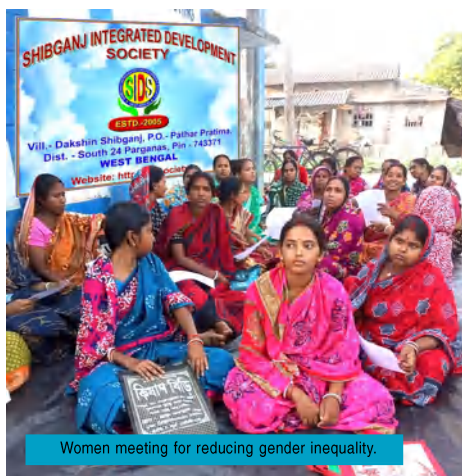
Women meeting for reducing gender inequality.

Wall writings are a good way to disseminate information in local languages. Seminars and camps on gender inequality can raise awareness by educating participants about gender-related issues, challenging harmful stereotypes, and promoting a more inclusive and equitable environment.