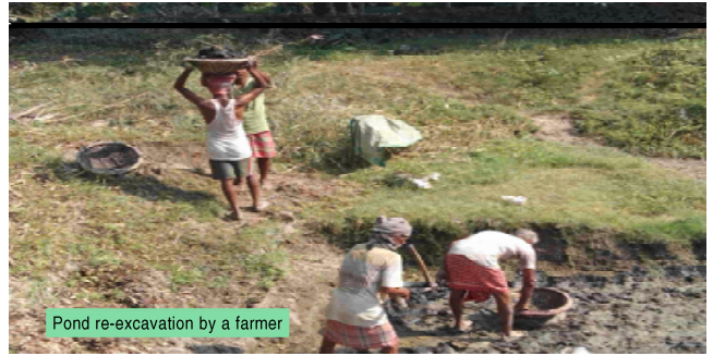
Pond re-excitation by a farmer

“TO BE A FARMER IS TO BE A STUDENT FOREVER, FOR EACH DAY BRINGS SOMETHING NEW”