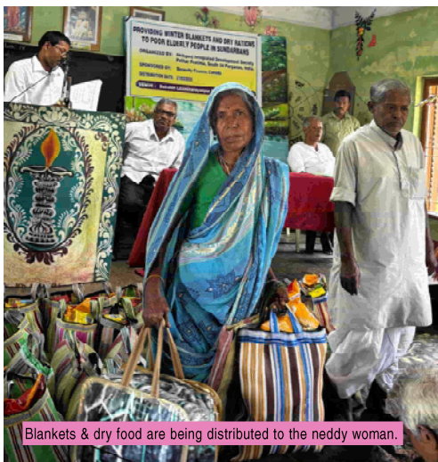
Blankets & dry food are being distributed to the needy woman.

There are numerous elderly people who exposed to various life problems living in total Sundarbans areas. These older persons are vulnerable to poverty, food insecurity, limited access to social and health services. The impact of the COVID-19 pandemic combined with acute economic stress has resulted in changed family structures in Sundarbans in