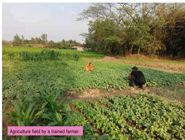
Agriculture field by a trained farmer

For development of sustainable agriculture practices, the organization adopted a few strategies which are: Farmers trainings, supply of seeds and fertilizer, supply of agricultural tools, re-excavation of ponds, and supply of fingerlings. The poor women, widows, handicapped persons, and minority