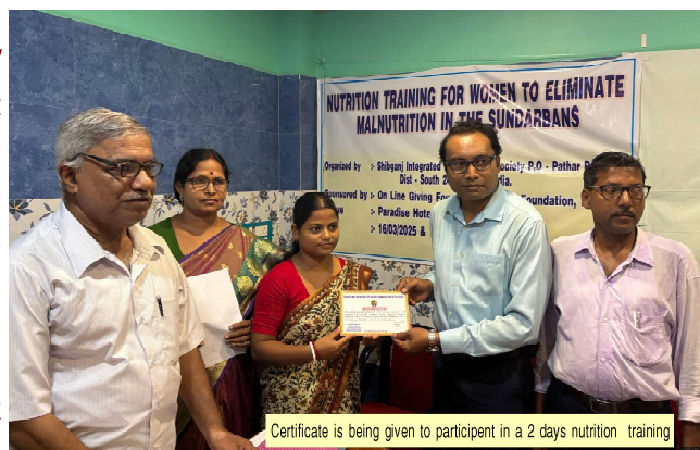
Certificate is being given to participant in a 2 days nutrition training

various reasons pregnant women are not following all the guidelines of AWC. Service delivery (Institutional Delivery & JSY) system is not functioning in a desired manner. Malnutrition is also cause acute problems, like hypoglycemia (low blood sugar). This condition can cause lethargy, limpness, seizures, and loss of consciousness. Children are particularly at risk