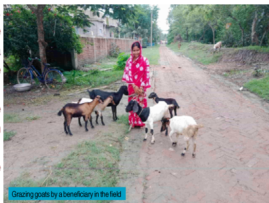
Grazing goats by a beneficiary in the field