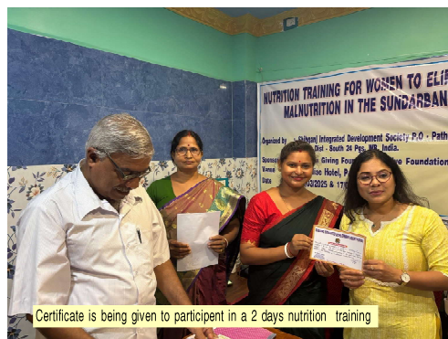
Certificate is being given to participant in a 2 days nutrition training

Shibganj Integrated Development Society (SIDS) is engaged in Health and Nutrition and based on our engagement it has been found that there is inadequate and improper food practices in Sundarbans areas along with poor hygiene which has led to 80% anemia among women and almost 50% malnutrition condition in children. Some factors that has been found are as follows: Traditional practices related to pregnancy and childbirth.