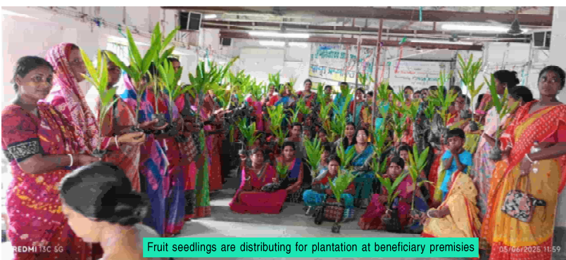
Fruit seedlings are distributing for plantation at beneficiary premises

own initiative. 25 women were trained in tree care. A staff member from the organization followed up on this project for a year. We know that home gardens with fruit trees can provide a steady supply of fresh fruits, reducing dependence on markets and potentially lowering food costs for households. Fruit trees into agricultural systems can improve soil fertility, and structure, contributing to sustainable agricultural practices. Fruit trees can be more resilient to climate change impacts than some other crops.