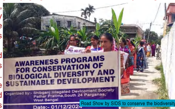
Road Show by SIDS to conserve the biodiversity

Our organization has implemented the seminar, wall writing and VIDEO showing programs with the aim of creating awareness among the public about conserving the Sundarbans ecosystem. Since the organization is located within the Sundarbans, we have prioritized biodiversity conservation. The organization collected some money from community contribution. The project was implemented with the remaining funds from the organization.