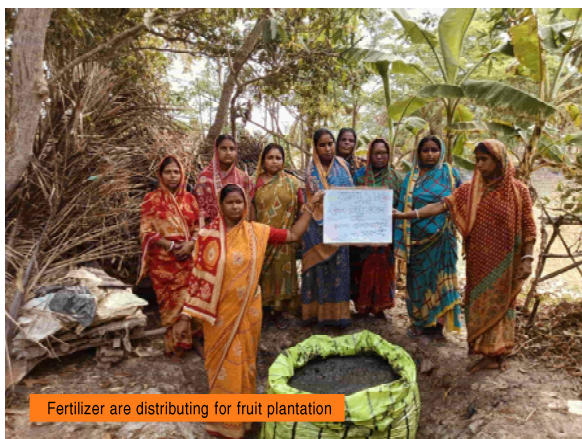
Fertilizer are distributing for fruit plantation

Fruit plantation at households in the Sundarbans offers a multitude of benefits, from enhancing food security and nutrition to promoting economic empowerment and environmental sustainability, making it a valuable practice for the region. Fruits are excellent sources of vitamins, minerals, and fiber, contributing to a balanced and healthy diet, which is especially important in areas where access to diverse food sources is limited. Fruit cultivation offers a viable alternative to traditional livelihoods, particularly in areas where agriculture is challenged by salinity and other environmental factors.