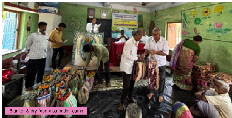
Blanket & dry food distribution camp

under Pathar Pratima block in Sundarbans under South 24 Parganas district in West Bengal State in India. The beneficiaries are provided one winter blanket and dry ration (Rice-4 kg, Musur Dal- 1 kg, Soya been- 1 kg, Mustard oil- 1 litre and Biscuits-400 grms). The project is funded by Benevity Causes, Canada.