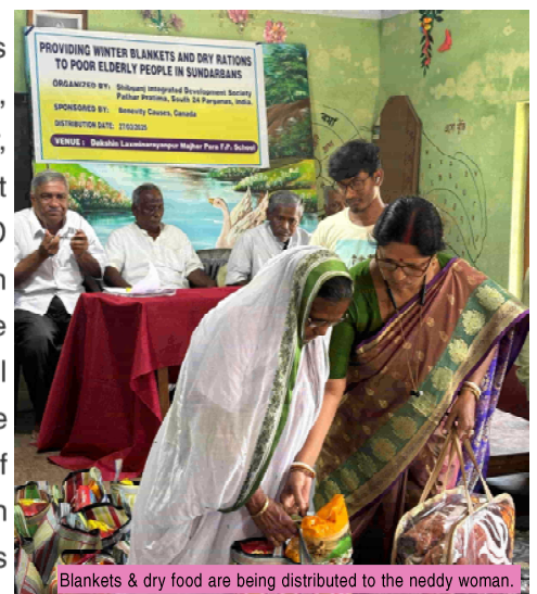
Blankets & dry food are being distributed to the needy woman.

impact. 50 poor elderly people have been selected in a meeting in presence of the stakeholders of four villages. These 50 people are the beneficiaries of this project. The beneficiaries belong to four villages like Dakshin Laxminarayanpur, Madhab Nagar, Dakshin Shibganj and Kishori Nagar villages